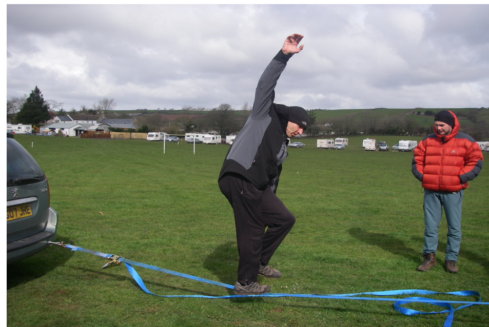
RIVELIN April 6 th

People that did not venture on this meet have missed what can only be described as a sublime experience. The day dawned clear and cold with a couple of inches of fresh snow. There was not a cloud in the sky. The drive to Hathersage was splendid, the visibility was fabulous and the covering of snow lent an air of majesty and grandeur to the familiar landmarks of the Peak. In time, we assembled at Longlands Cafe where the usual crap service was evident. [We really must find a better meeting point.... 3/4hr for a breakfast! Cintra's is just a few yards away and is much better, or we could also consider the Pool Cafe].